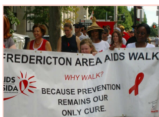
Pictured right: Fredericton Area AIDS Walk, September 9, 2007.