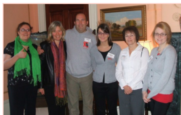
Pictured left: Staff and volun- teers during World AIDS Day Breakfast 2007